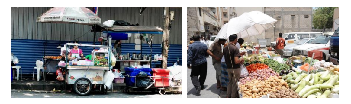
Figure 1. The classic way of street vending

COVID-19 and health issues are part of the constraints that threaten to deal with street vending that depend upon the bodily experiences and physical interaction in direct contact between the sellers and buyers in the places of the street vending. Therefore, the contemporary overview of street vending in Bahrain and the modernization of the vending concept focus on food trucks, which are significant issues underlying its permanence as a phenomenon in terms of the social, economic, and environmental aspects. There are ambivalent attitudes toward it by governments and off-street business communities directly on street vendors, especially for foods, as an occupational group (Indira, 2014).