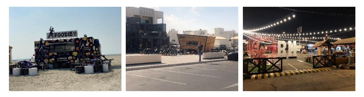
Figure 7. Using eye-catching sitting areas, decorative design, night landscape design, and well-designed car parking to attracted people