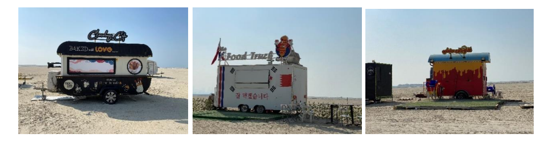
Figure 4. Different designs and styles of food trucks

Explicitly, food trucks are a livelihood; consequently, this moves the strategy of dealing with such activities away from criminalizing street trade to make it more productive (Roever & Skinner, 2016). Many workshops worldwide took it as a profitable business (Truck, 2017). (Figure 3). At the same time, many observers still equate them with pollution, risks to health and safety, tax evasion, and shoddy product sales concerning the impleading of the idea in the urban spaces. Dealing with food trucks needs more attention to avoid harming the visual, social, traffic, health quality, etc. Planning open spaces and designing the urban landscape need more profound studies (Eldardiry & Elghonaimy, 2016). Recently, food trucks replaced street vendors in a modern form by providing the needed services in a dynamic and civilized shape (Bromley, 2000).