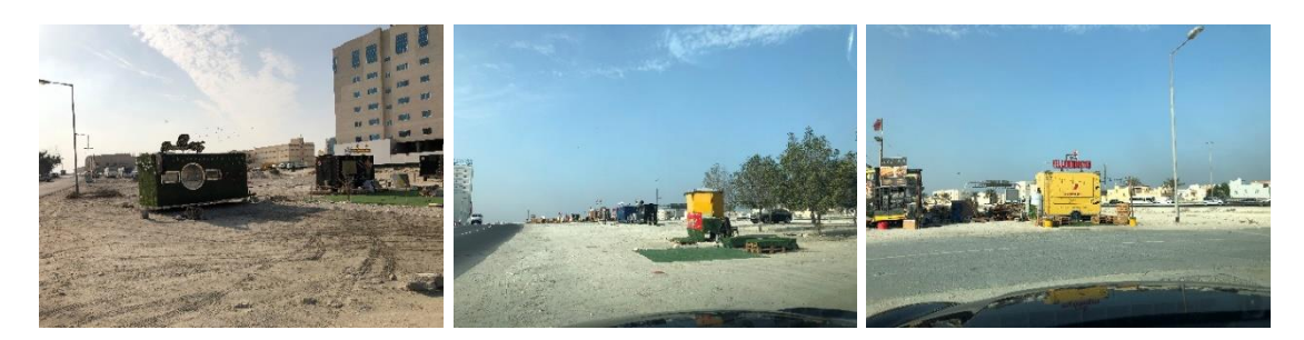
Figure 9. Food trucks in Al Salam hospital area show the improper sitting for the location and the visual pollution, and the hazards of the way of dealing with their waste