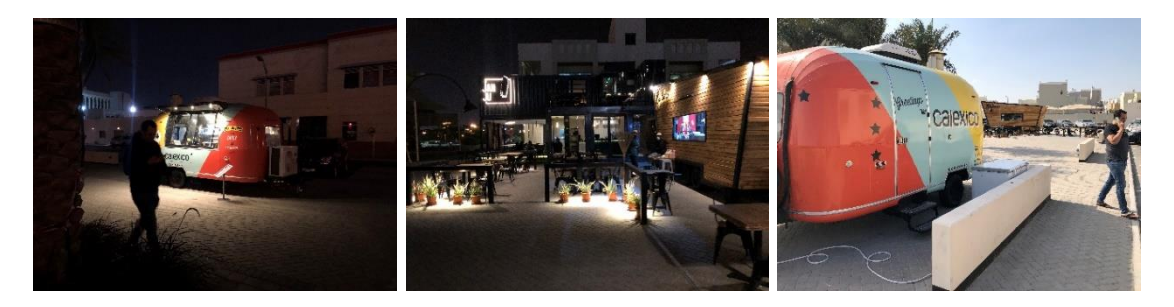
Figure 10. Food truck well-designed location in Zayed town

b. The responses for users within the Food Trucks site (Table 2)