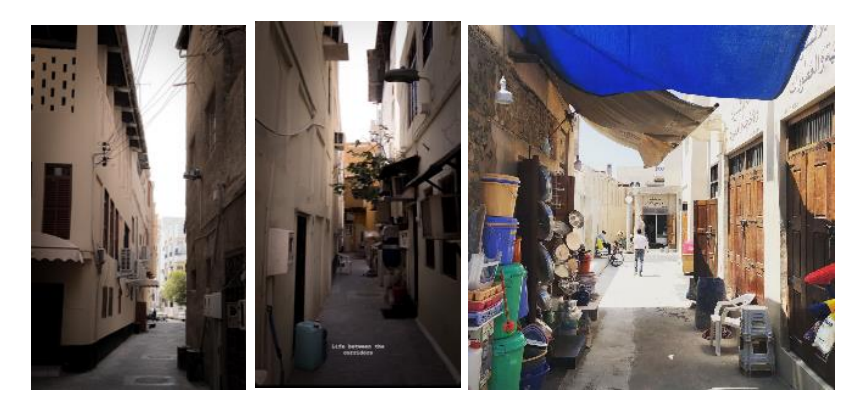
Figure 2. Traditional conjunction of urban fabrics and narrow streets that only allow small vehicles to enter the old part of Manama city, Bahrain.

In a report from Gulf insider, in Manama (the capital of Bahrain), 468 stalls of general street vendors were removed in the first quarter of 2020 to address the phenomenon of violating vendors across markets and commercial outlets as part of its efforts to protect the health and safety of consumers. According to the Labour Market Regulatory Authority statistics, in 2020, the number of violating vendors will be less than that of the same period in 2019. It is a result of the preventive measures taken by the Government Executive Committee to combat the novel COVID-19 due to the general lockdown in Bahrain. Figure 1 indicates the lack of proper hygiene procedures, a hazard due to the high possibility of transferring COVID-19 infections. Therefore, in Bahrain, the Cabinet's approval was to control the hazards resulting from the proper activities by all street vendors (Vinita, 2020) (Itikawa, 2013).