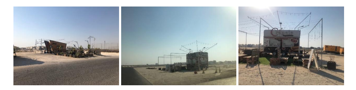
Figure 8. Food trucks in the Zallaq area