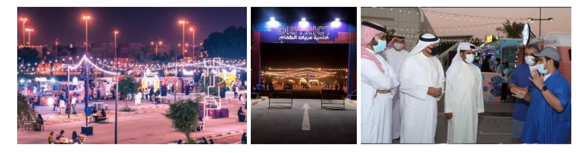
Figure 6. The site assigned by the Bahrain authority called 'District' in the stadium area