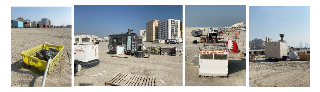
Figure 3. Examples of the problems due to improper infrastructure networks